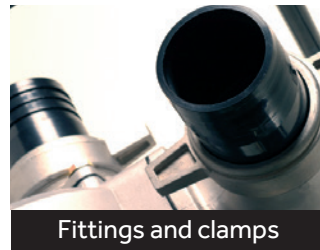
Fittings and clamps